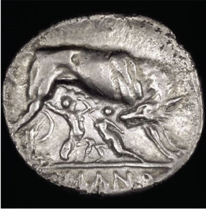
Fig. 6: Romulus and Remus breast-fed by she-wolf. Silver didrachm (6.44 g), ca. 269–266 BC.

“any natural aggressive drive and argues that human beings can overcome their violent nature” and holds the “Jesus’s calls for nonviolence [...] as a plausible, objective, yet very complex attempt to argue for an overcoming of violence” (Palaver, 2013, 35). Contrary to Hobbes’s liberalist political philosophy in defending essential individualism, Girard’s mimetic theory describes man as a social being dependent on relations to others (Palaver, 2013, 36–37). As an example of life outside the rivalry resulting from mimetic desire, Girard believed the love of parents for their children cannot be interpreted as mimetic (Girard, 1996, 28). However, is it possible to interpret tales about abandoned children as cases of mimetic desire?