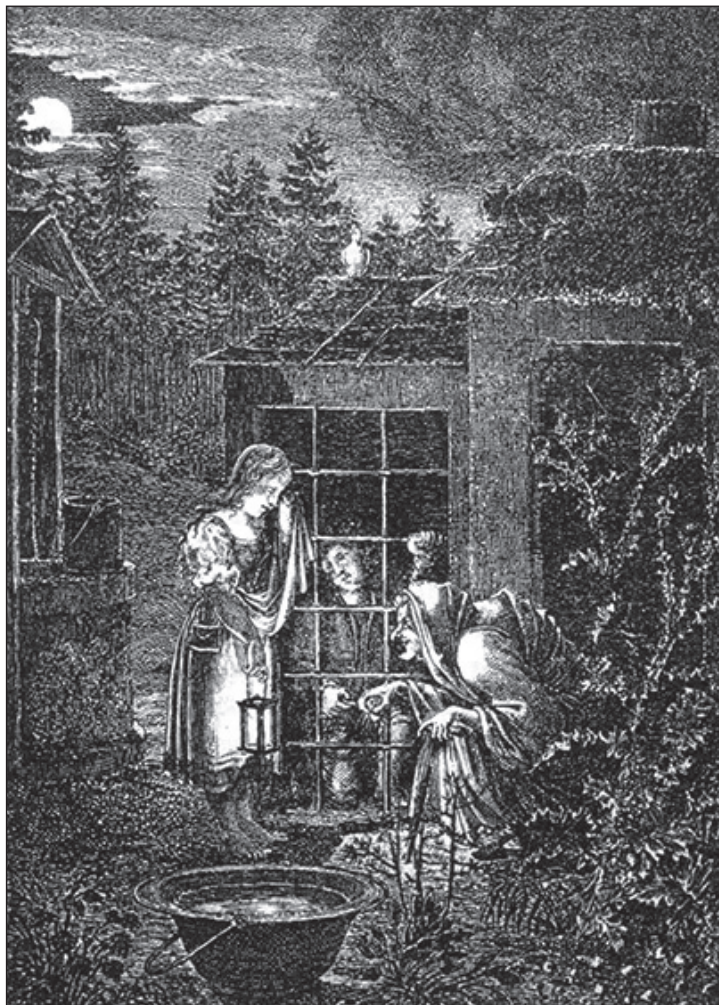
Fig. 1: Ludwig Emil Grimm, illustration of Hänsel behind the bars from "Hänsel und Gretel" (Grimm, 1825, 89).

the Tiber River by their old uncle, who had usurped the throne. They were rescued by a she-wolf who suckled them.