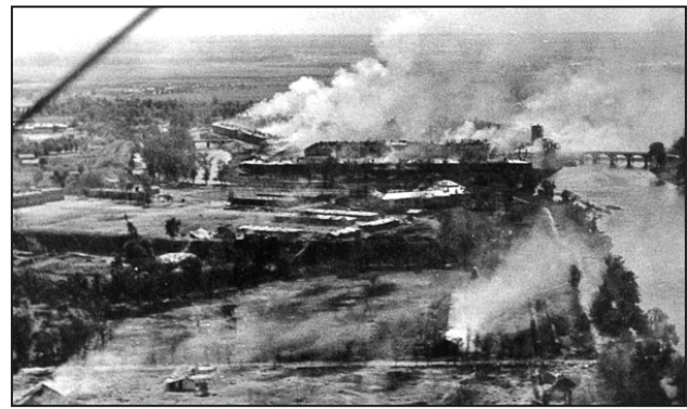
Fig. 1: Artillery Shelling on June 22, 1941 ( https://military.wikireading.ru/7957 )

Wehrmacht started the attack with a 29-minute shelling with artillery at 3:15 in the morning Berlin time (Fig. 1). Every 4 minutes the artillery fire was moved 100 meters to the east. At 3:19 the assault detachment in 9 inflatable boats headed to capture the bridges. At 3:30 German Infantry Company supported by sappers took the railway bridge across the Bug River. By 4:00 the detachment captured two bridges connecting West and