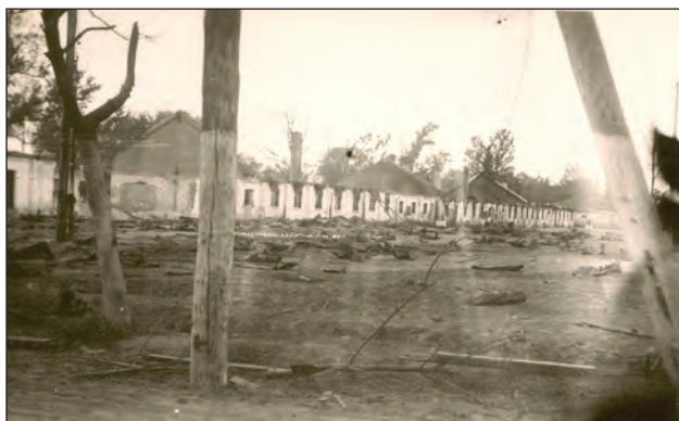
Fig. 3a: The ruins of location of the 131 st Light Artillery Regiment (Aliev & Ryzhov, 2013, 66)