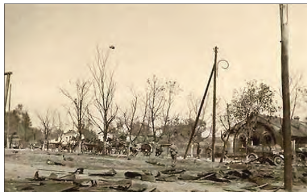
Fig. 3b: The ruins of location of the 131 st Light Artillery Regiment (Aliev & Ryzhov, 2013, 58)

and officers were enlisted in the 131 st LAR, but like all the units stationed in the Brest Fortress, not all privates of the 131 st LAR were there on the night of June 21–22, 1941 (The Brest Fortress, 1963).