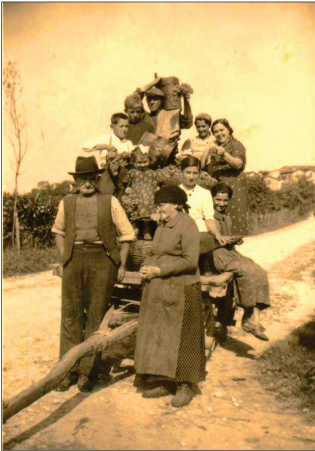
Image 2: Harvesting in Medana: in the foreground the mother and father of Alojz Gradnik, in the background relatives. On the top, with a jug in his hands, a Friulian worker