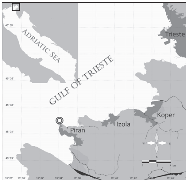
Fig. 1: Map of the northern Adriatic Sea with the studied area. The sampling locality of Melibe viridis is presented with a circle.

Despalatović et al. (2002) published the first records of M. viridis for the Adriatic Sea in waters off the island of Hvar (Croatia) and Jančić (2004) reported it close to the city of Herceg Novi (Montenegro). Recently, Mandić et al. (2016) reported on spawning of this species in Boka Kotorska Bay (Montenegro) in October 2014.