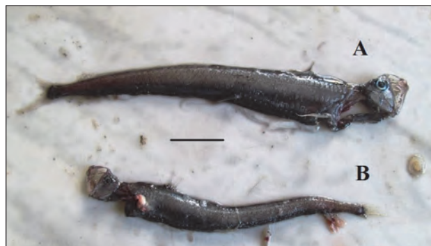
Fig. 2: Chauliodus sloani , northern Tunisian region. A. Specimen referenced INSTM Chau-slo 01. B. Specimen referenced INSTM Chau-slo 02, scale bar for both specimens = 35 mm.

Sl. 1: Zemljevid Sredozemskega morja z Tunizijo (pravokotnik) in označbo lokalitete (črna zvezdica), kjer sta bila ujeta primerka Chauliodus sloani na severu države.