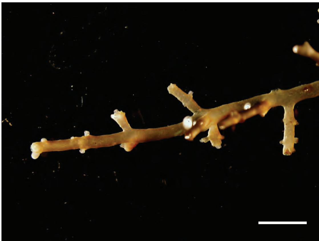
Fig. 2: Details of the apical portion of Laurencia obtusa ; scale bar: 5 mm.

Sl. 2: Podrobnosti apikalnega dela vrste Laurencia obtusa ; velikostna lestvica: 5 mm.