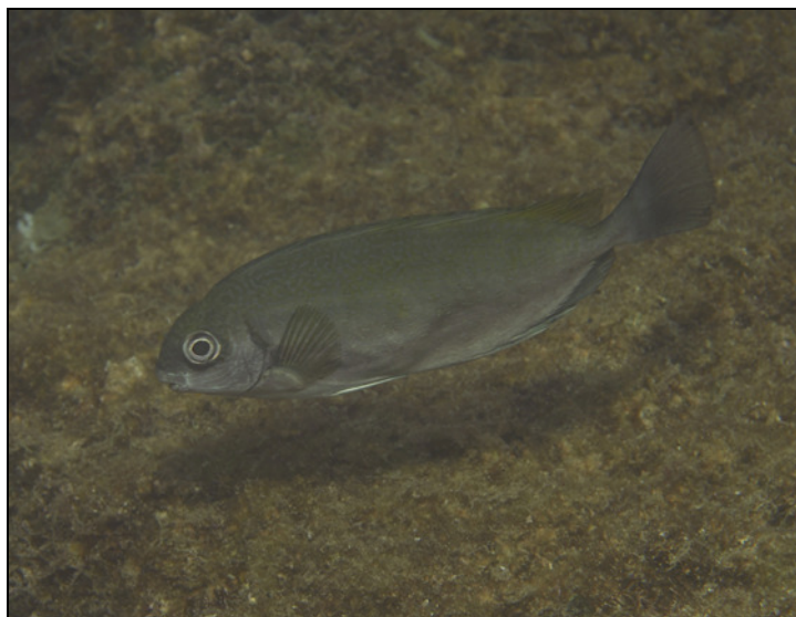
Fig. 1: Specimen of Siganus luridus , photographed at the locality of Bagno Ducale in the WWF Miramare Marine Protected Area, Trieste. Sl. 1: Primerek vrste Siganus luridus , fotografiran na lokaliteti Bagno Ducale znotraj zavarovanega območja WWF Miramare pri Trstu.

On the basis of the set of digital photos, the specimen was identified as a member of the family Siganidae, according to its typical body shape and colour pattern. The species was determined due to the typical truncated caudal fin, which is forked in similar Lessepsian species