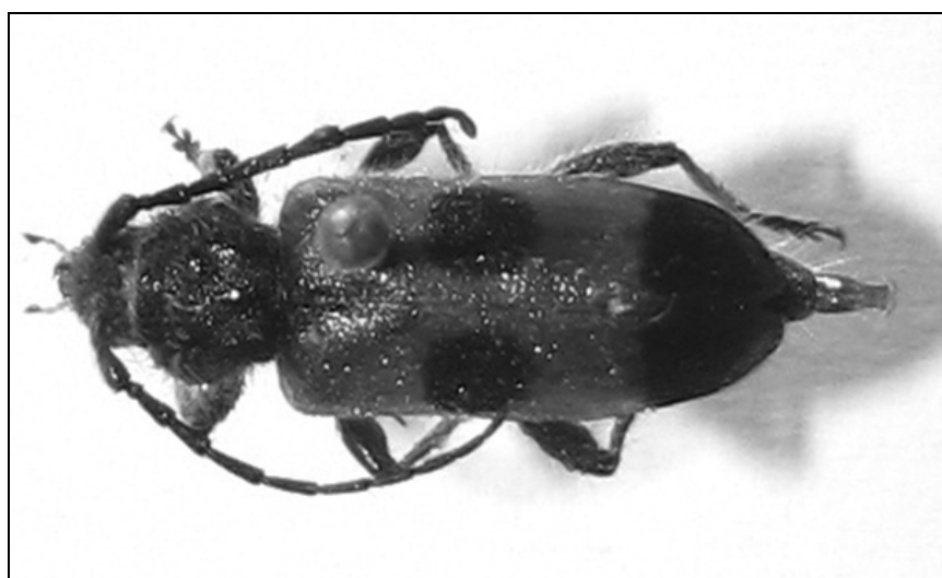
Fig. 2: Rare longhorn beetle, Semanotus russicus (Fabricius, 1776) found in Juniperus stumps. Sl. 2: Redka vrsta kozlička Semanotus russicus (Fabricius, 1776), najdena med debli brina.