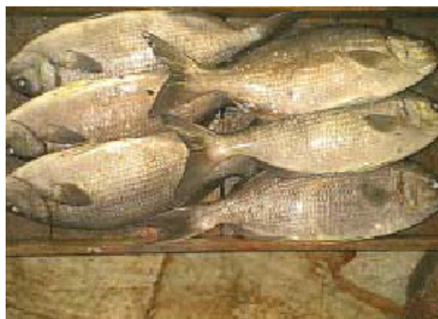
Fig. 1: A number of Bermuda sea chubs captured off the eastern Algerian coast and observed at Algiers fish market.

Measurements, counts, description and colour are in agreement with Tortonese (1975, 1986), Fischer et al. (1981) and Séret & Opic (1990).