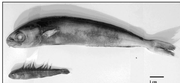
Fig. 2: Juvenile specimens of C. hippurus from the Adriatic Sea. Sl. 2: Mladostna primerka C. hippurus iz Jadranskega morja.

fins were black, while the pectoral ones were white. Tips of the caudal fin were white in both specimens, while the rest of the fin was brown.