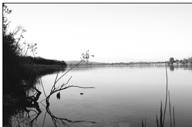
Fig. 2: Eastern branch of the Bojana/Buna delta on the borderline between Albania and Montenegro; location of dolphin sighting on June 12 th , 2003. Sl. 2: Vzhodni rokav delte Bojane/Bune na meji med Albanijo in Črno goro; lokacija opazovanja velike pliskavke dne 12. junija 2003.

Sl. 1: Opazovanja velikih pliskavk Tursiops truncatus v delti Bojane/Bune v letu 2003. Polni krožci: opazovanja s strani avtorjev; prazni krožci: opazovanja s strani domačinov. Velikost simbolov ponazarja velikost skupine velikih pliskavk (min: 1, max: 6 osebkov).