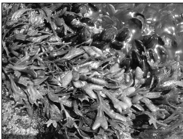
Fig. 2: F. virsoides in the Risan bay.

The ramification of all collected samples is typically dichotom-dichopodial, with numerous proliferations appearing on the bitten parts. There are also many anomalous formations on the thallus, but as Boka Kotorska Bay is one of the southernmost limits of its range, the morphological variability of the collected samples was not taken into consideration.