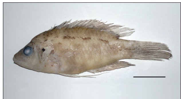
Fig. 2: Sideburn wrasse P. pelycus captured off the Syrian coast (specimen referenced 260 M.S.L, in the Ichthyological Collection of Tishreen University, Syria); scale bar = 20 mm.

tips of dorsal fins, caudal fin rounded, lateral line complete with dark brown-red spots, mouth terminal slightly