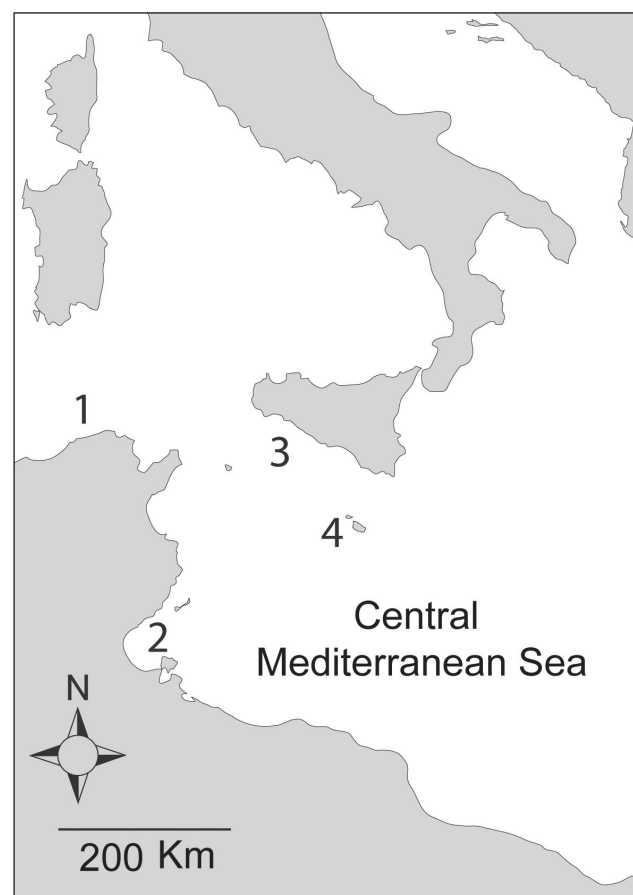
Fig. 3: Map of the central Mediterranean Sea pointing out the capture sites of H. perlo . 1: northern Tunisian coast (Capapé, 1980; this study); 2: Gulf of Gabès, southern Tunisia (Bradai, 2000); 3: Sicily (De Maddalena et al., 2002); 4: Malta (Schembri et al., 2003). Sl. 3: Zemljevid osrednjega Sredozemlja z označenimi lokalitetami, kjer so bili ulovljeni morski psi sedme-roškrjarji. 1: severna tunizijska obala (Capapé, 1980; pričujoča raziskava); 2: Gabéški zaliv, južna Tunizija (Bradai, 2000); 3: Sicilija (De Maddalena et al., 2002); 4: Malta (Schembri et al., 2003)

The specimens collected on 1 April 2007 and 15 July 2008 were a male and a female measuring 810 mm and 1100 mm TL, respectively and weighing 3000 g and 5000 g, respectively. Taking in account previous observations of Capapé (1980), both were adults. The two specimens caught on 21 May 2014 were juvenile. Additionally, the fact that no viscous substances were secreted by the internal surface of clasper sheath of the adult specimen enhances such statement (Tanaka et al., 1975; Capapé, 1980; Frentzel-Beyme & Köster, 2002).