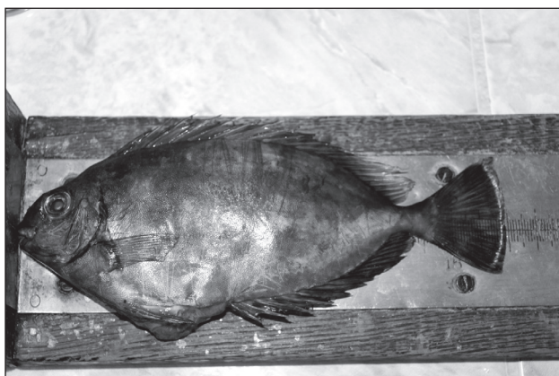
Fig. 1: A specimen of Siganus luridus caught in Bigova (cape Trašte) (southern Adriatic Sea, Montenegrin coast).

The morphology of the observed specimen agrees with taxonomic description in Dulčić & Dragičević (2011). The specimen was carefully measured with a calliper and weighed. The specimen is preserved and